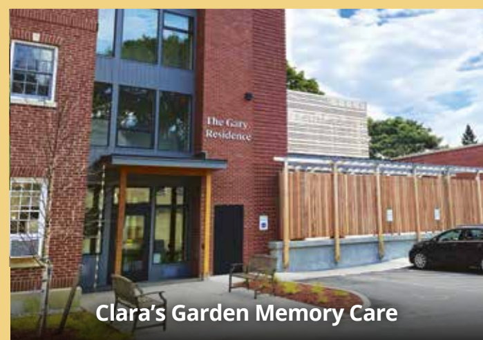
Clara's Garden Memory Care

“The ease with which my dad transitioned to being away from what he knew is a testament to the staff. In a short period of time he was truly comfortable, and we were thrilled when he began referring to it as home.”